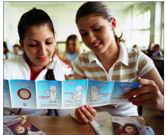
High school students in Bucharest, Romania, examine a condom advice leaflet and other contraceptive educational materials during a talk on sexual health. Peter Barker (Panos Pictures), 2006

Unsafe abortion carried out by individuals lacking the necessary skills and/or in unhygienic conditions, is a major global public health problem. The practice occurs where abortion is legally restricted, and where access to safe services is inadequate although the law may broadly permit the procedure. Unsafe abortion causes death and ill health in women, and