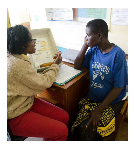
Patient being counseled by her HIV care provider on family planning options at Nyadenda Health Center, Kenya

There were costs associated with the training and equipment described in Box 1 at both integrated and control sites. On average, these costs were $4,859 per site at the integrated sites and $4,018 per site at the control sites. The bulk of these costs were personnel costs, as well as expenditures related to refresher training, mentoring, and supportive supervision. Combining these costs with the observed increase in use of FP at integrated sites resulted in a cost of $65 per additional user of more effective contraception. The cost per incident pregnancy averted was $1,368.