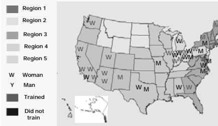
Qualitative study participants