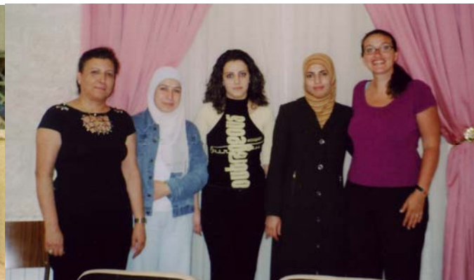
Young women's health and sexuality study team, Palestine

To join the Ibis Reproductive Health mailing list, please email admin@ibisreproductivehealth.org .