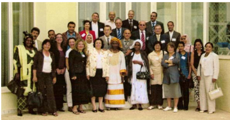
Medication abortion symposium participants and organizers.